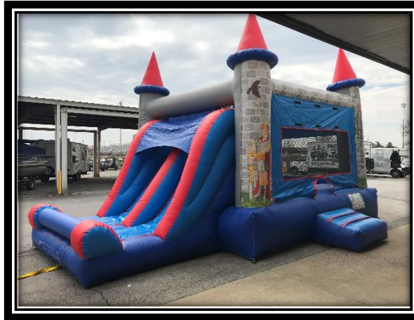
DUAL MEDIEVAL CASTLE