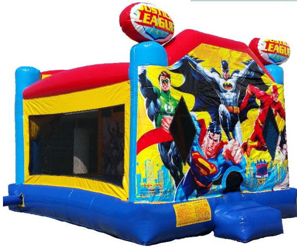
JUSTICE LEAGUE COMBO