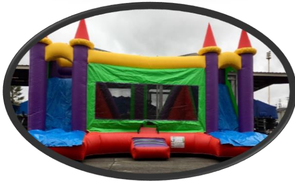
GIANT CASTLE COMBO