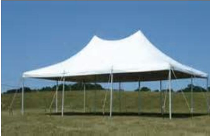
20X30 POLE TENT Qty. 4

DAILY: $205 WEEKEND: $410 HOLIDAY WEEKEND: $512.50 *3 person team min. set up.