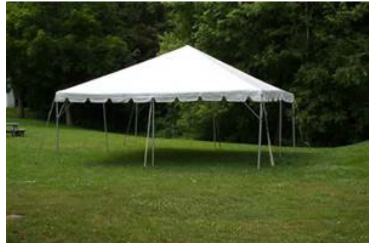
20X20 FRAME TENT Qty. 2