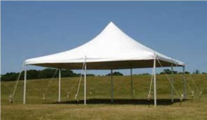
20X20 POLE TENT Qty. 3