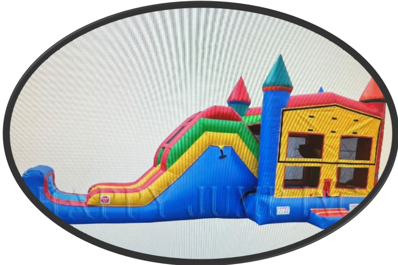
HOP N SLIDE L 30' W 11' H 14'