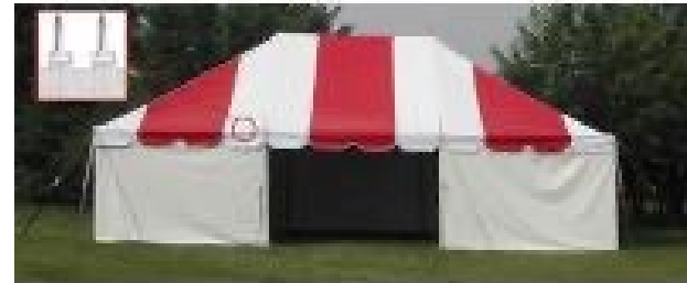
20x20 FRAME TENT Qty. 1