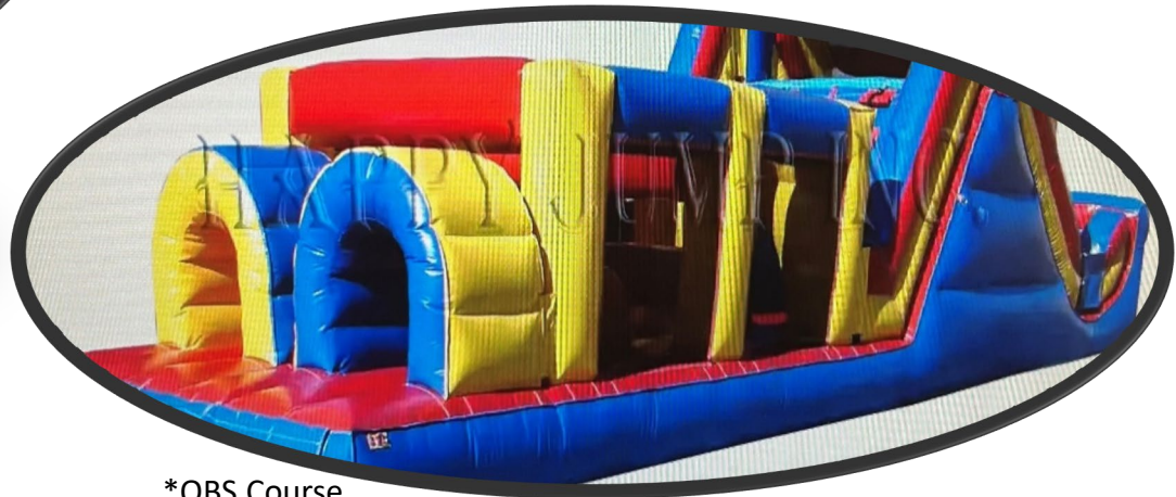
FRONTYARD OBS L 40' W 11' H 13'