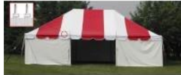
20x20 FRAME TENT