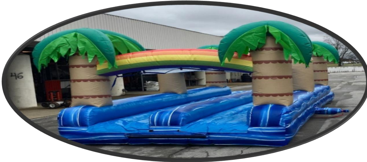
TROPICAL DUAL SLIP N SLIDE