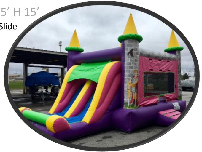
GIANT CASTLE COMBO