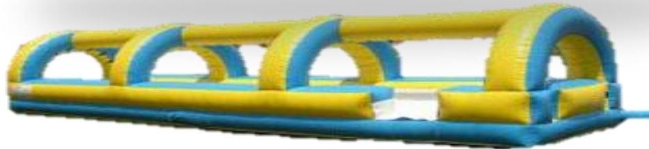
HIGH TIDE SLIP-N-SLIDE