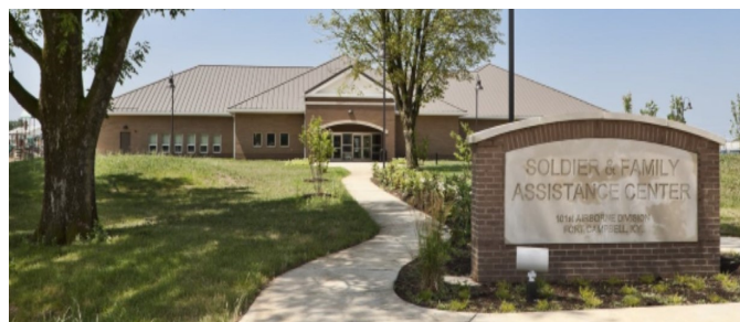
The Soldier and Family Assistance Center (SFAC)

The Army recognizes that the nation comes together in many different ways to honor the sacrifices made by Soldiers and their Families and to contribute to warrior care. For further information and registration call the SFAC at (270) 412-6000 or the ACS Facebook page.