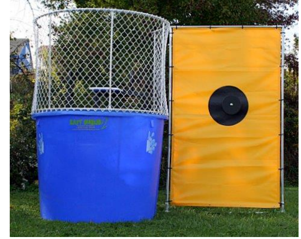
DUNKING BOOTH DAILY: $80