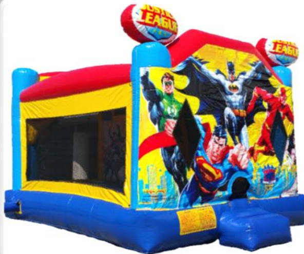
JUSTICE LEAGUE COMBO