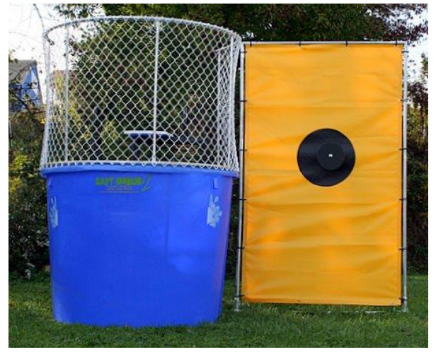
DUNKING BOOTH DAILY: $80