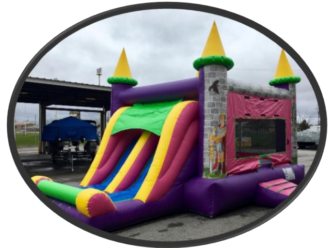
DUAL PRINCESS CASTLE