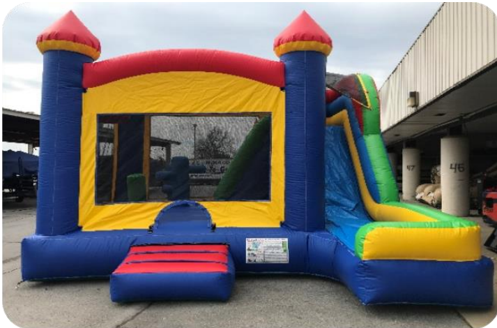
5-IN-1 CASTLE COMBO L 19' W 18' H 16'