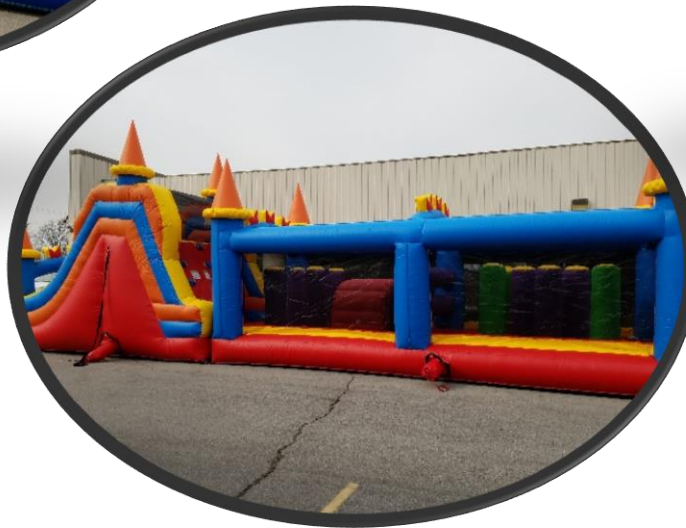
CASTLE COURSE OBS