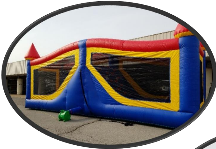
LARGE CASTLE COMBO