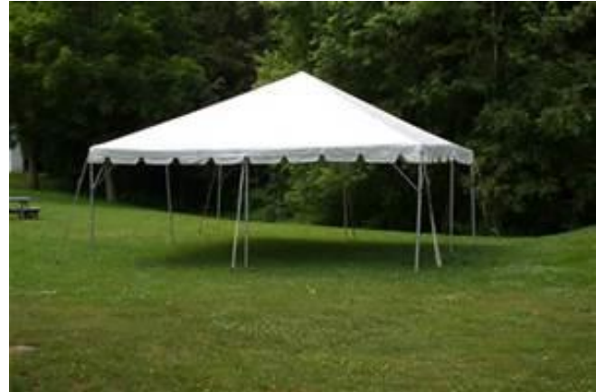
20X20 FRAME TENT