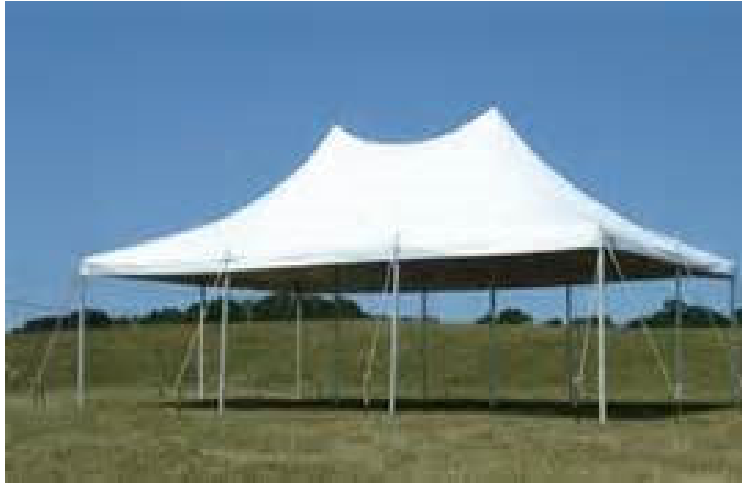
20X30 POLE TENT Qty. 4