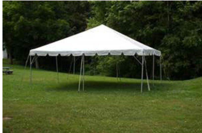
20X20 FRAME TENT Qty. 2