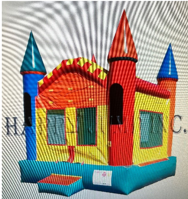
CASTLE 1 L 13' W 13' H 14'