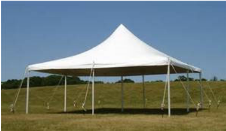
20X20 POLE TENT Qty. 3

DAILY: $150 WEEKEND: $300 HOLIDAY WEEKEND: $375 *3 person team min. set up.