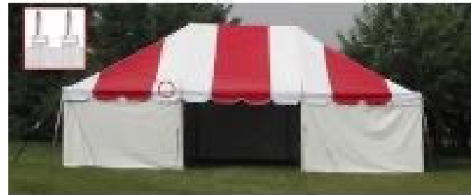
Red & White