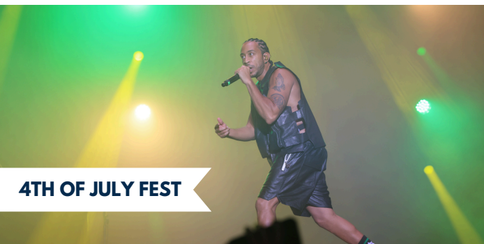
4TH OF JULY FEST