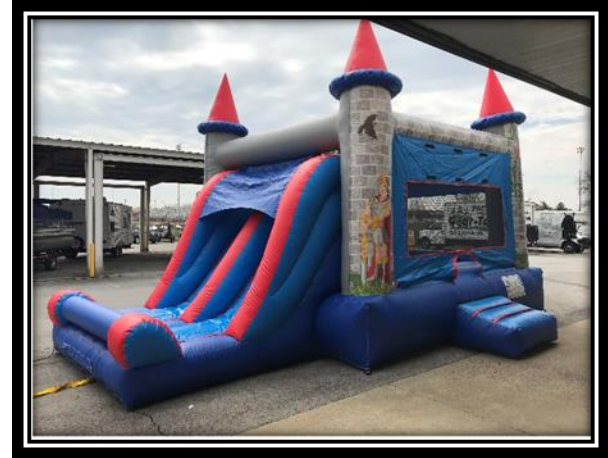
5-IN-1 CASTLE COMBO L 19' W 18' H 16'