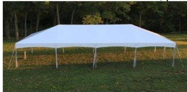
20X40 FRAME TENT Qty. 2

DAILY: $200 WEEKEND: $400 HOLIDAY WEEKEND: $500 DELIVERY CHARGE: $200 *3 person team set up.