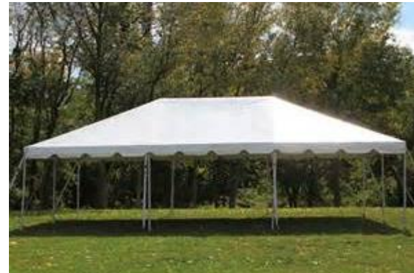
20X30 FRAME TENT Qty. 2

DAILY: $175 WEEKEND: $350 HOLIDAY WEEKEND: $437.50 DELIVERY CHARGE: $200 *3 person team min. set up.