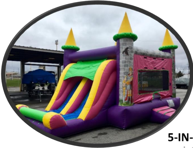
L 23' W 15' H 15' DUAL PRINCESS CASTLE