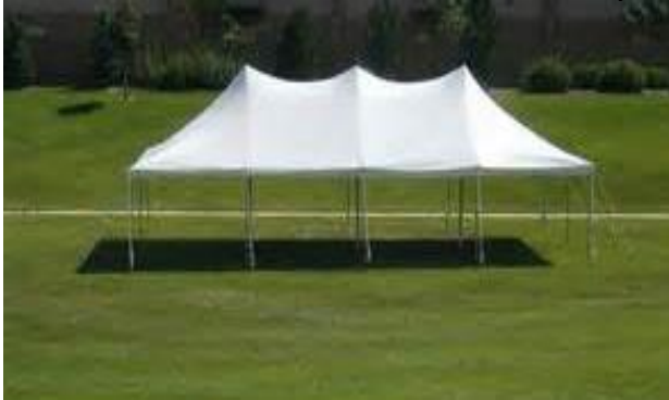
20X40 POLE TENT Qty. 3

DAILY: $200 WEEKEND: $400 HOLIDAY WEEKEND: $500 DELIVERY CHARGE: $200 *3 person team set up.