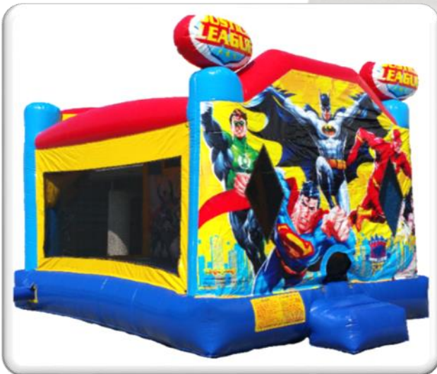
JUSTICE LEAGUE COMBO