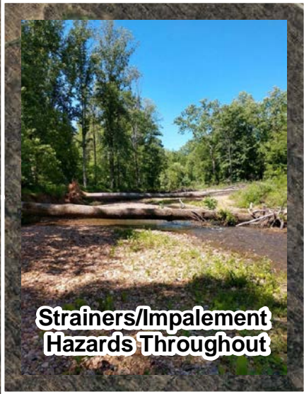
Strainers/Impalement Hazards Throughout