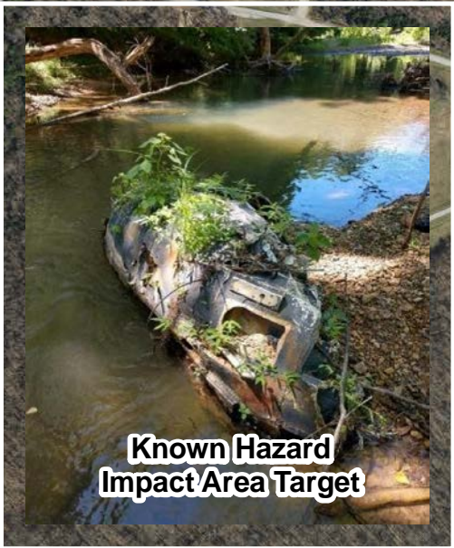
Known Hazard Impact Area Target