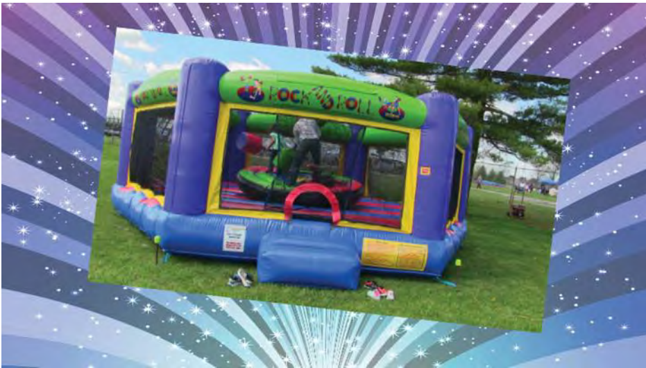
Gear to Go Birthday Bash Sat., August 17, 2019