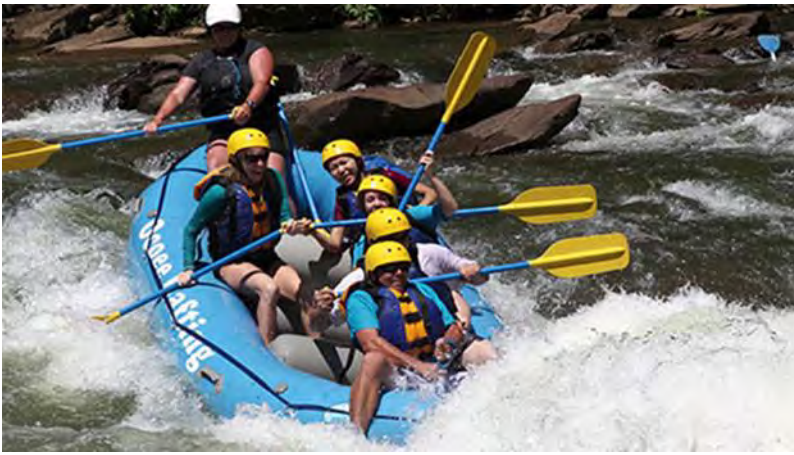
Whitewater Raft the Ocoee Fri-Sun August 16-18